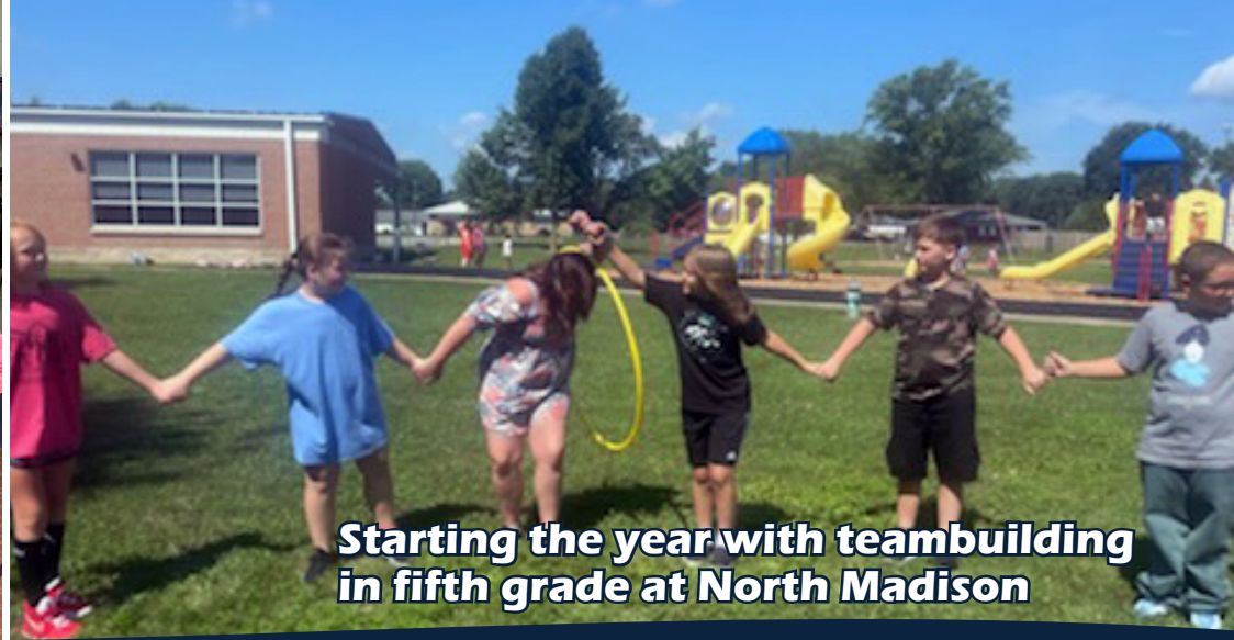
Starting the year with teambuilding in fifth grade at North Madison